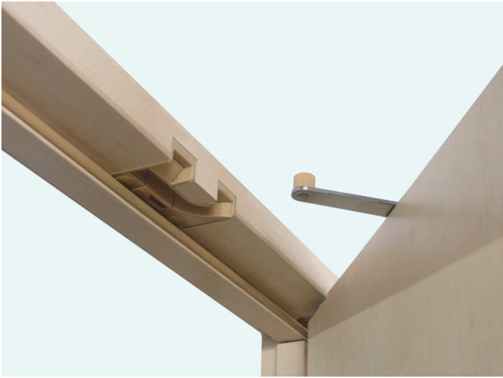
The arm extends once it is released from the spool bracket.